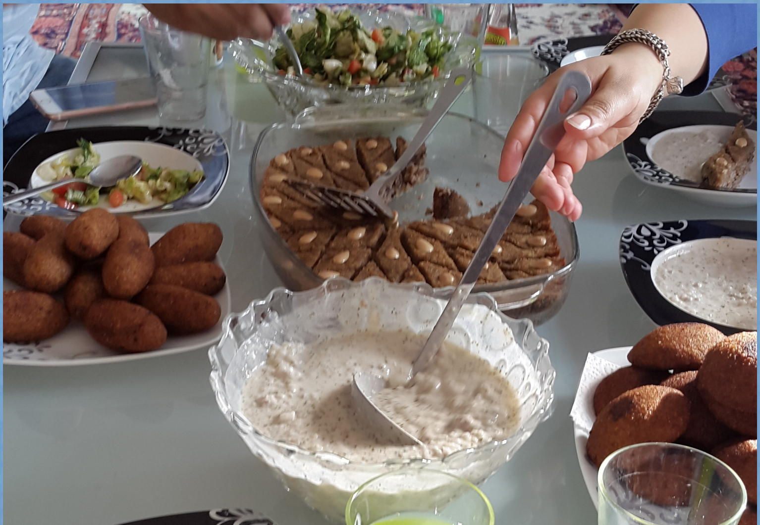
Aleppian family in Germany gather for lunch: kibbeh.